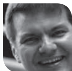
Prof. David Zaruk, 'The grand challenges facing the food industry on the road to 2050'