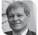
Commissioner Dacian Ciolos, DG Agriculture and Rural Development, European Commission